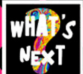
WHAT'S NEXT SUN Barham Services Club