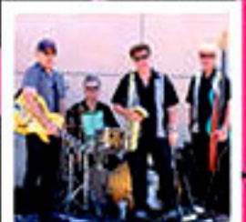
KNOCK KNOCK RATTLE FRI Barham Services Club