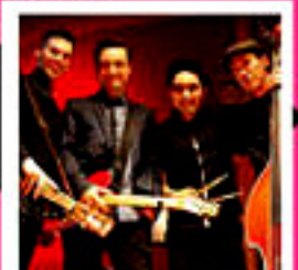
SMOKIN' WINGTIPS FRI SAT cluBarham Golf & Sports