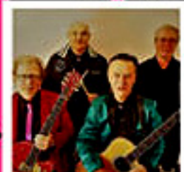
MYSTERY TRAIN THU FRI Barham Services Club