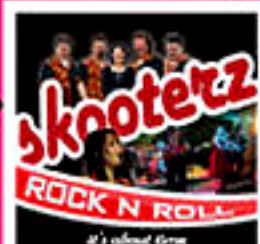
SKOOTERZ SAT SUN Barham Services Club

THURSDAY 23RD TO SUNDAY 26TH AUGUST COMMENCES 7pm THURSDAY, CONCLUDES 10pm SUNDAY