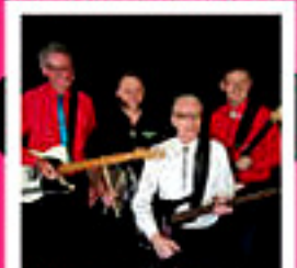
THE DELMATICS SAT SUN Barham Services Club & Riverside Pk